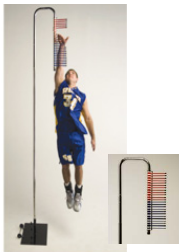
New! The Vertical Challenger from Tandem Sport

Get a jump on the competition with the Vertical Challenger! Easily one of the most affordable vertical jump testers on the market, the Vertical Challenger accurately measures vertical jump from 4 to 12 feet.