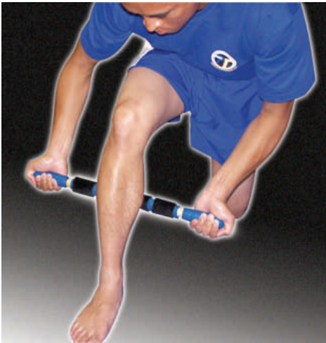
New from Pro-Tec — Roller Massager

Pro-Tec has already established itself as the #1 sports medicine manufacturer in specialty running. From knee sleeves to back supports, people look to Pro-Tec for injury relief and to keep them active. With so many people turning to massage therapy to reduce stress and improve circulation, Pro-Tec has joined in the race with the addition of the Roller Massager.